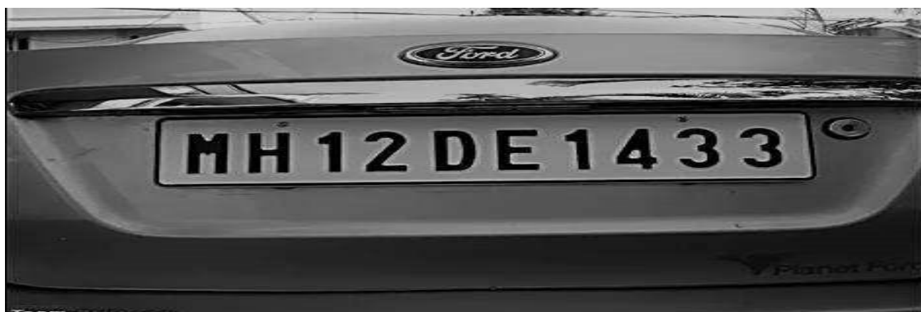
Figure 3:-RGB to Gray Format

In this method we will work on the image taken as the input from the CCTV footage which is in RGB format. We will be converting that image into gray scale using MATLAB.