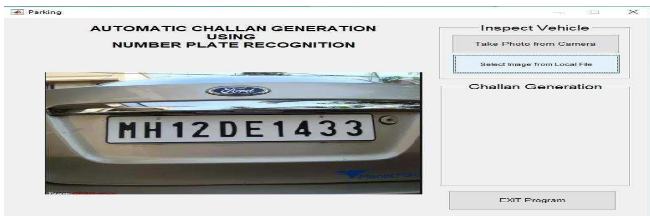
Figure 2:-Car Image