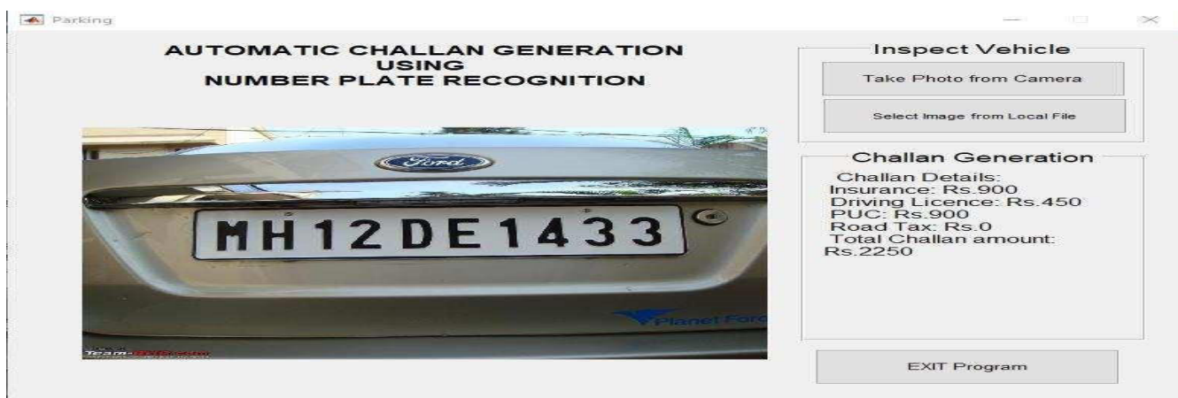
Figure 5: -Challan Generation