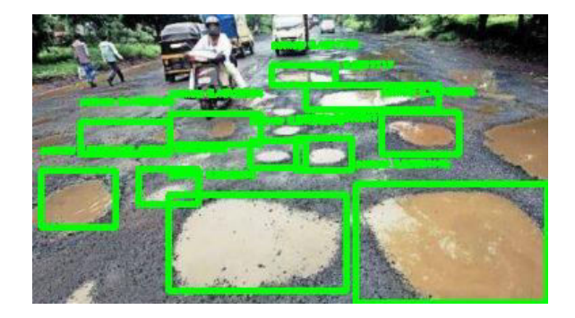
Fig 2 Potholes Detected Image