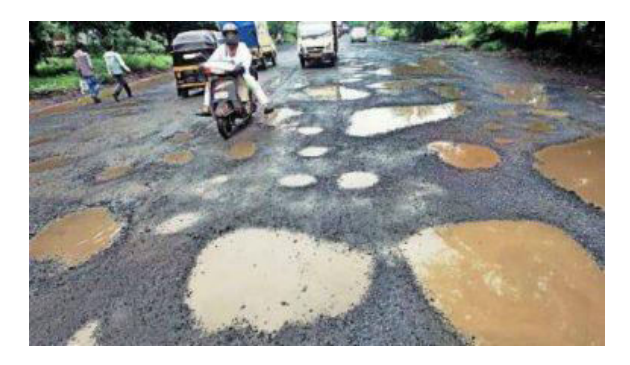
Fig 1 Orginal Image