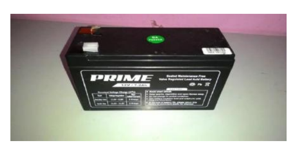
FIG NO: 1 Battery Specifications:

optimized with respect to available energy and local demand pattern. We use lead acid battery for storing the electrical energy from the solar panel for lighting the street and so about the lead acid cells are explained below.