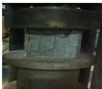
Fig.3. Cube under Compression Test

A = Cross sectional area of the specimen in mm^2