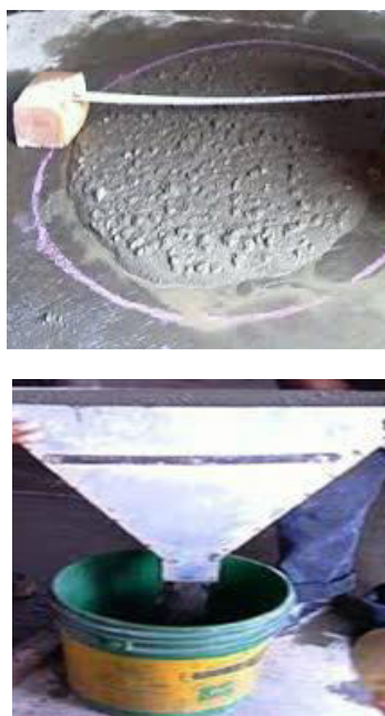
Fig.2.Slump and V-funnel test