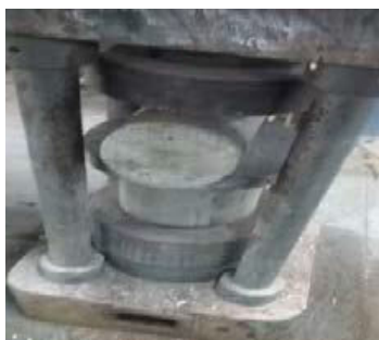
Fig.4. Specimen under Split Tensile Test