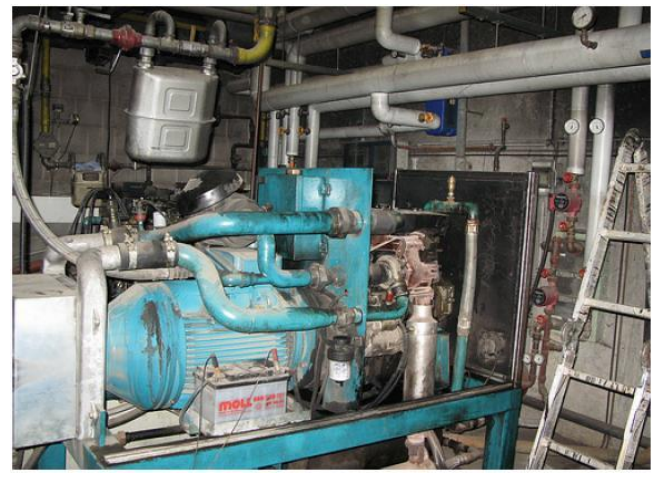
Fig 3. Combined heat and power (CHP) unit [7].

less expensive than small gas turbines. Gas turbines are found to be more efficient when operating in a cogeneration cycle (i.e. simultaneous production of heat and electricity). Biogas is burned for running a generator (e.g. micro turbine).