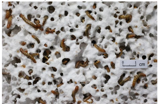
Fig 1. Mealworms munching on Plastics [6]

Mealworm, the tiny worm, which is the larvae form of the darkling beetle, can subsist on a diet of Styrofoam and other forms of polystyrene, according to Wei-Min Wu, a senior research engineer in the Department of Civil and Environmental Engineering at Stanford. Microorganisms in the mealworms' guts degrades the plastic.