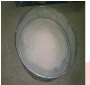
a) Crushing of waste glasses