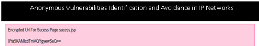
Fig. 3 Abstract Request