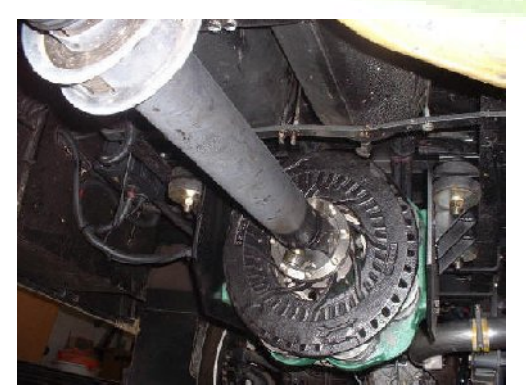
Fig. 3. Retarder installed on drive

Retarder is used in the secondary braking system. The above mentioned properties is often difficult to obtain in a bus by using the actual braking system, while moving. So a secondary braking system is introduced to overcome this effect. And retarder is used in the secondary braking system since it is very compact and easy to install on buses. Retarders are widely used as a secondary braking system in heavy trucks and other heavy vehicles to prevent overheating and wear of the primary braking system when carrying heavy loads. Retarder is installed on the output shaft of the gearbox. The retarder when switched on generates opposite torque to the output shaft resulting in the gradual slowing of the vehicle.