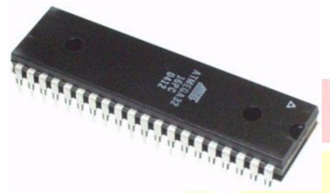
Fig. 2. Microcontroller

Passive Infrared sensors as the input. The circuit is programed to actuate the retarder and disengage the accelerator when the sensor detects the presence of passenger on the footboard. The microcontroller also sounds alarm to warn the passenger and the bus crew along with this. When the signal from the sensor is received by the microcontroller circuit, as preprogrammed the circuit disengages the accelerator and actuates the retarder and sounds the alarm.