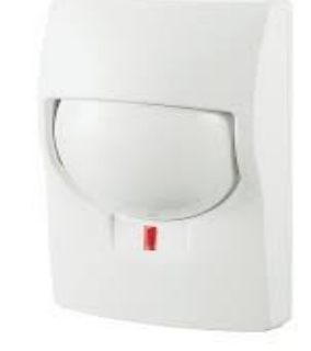
Fig. 1. Passive Infrared Sensor

Among the above sensors, Passive Infrared sensors are more effective for detecting passenger presence on footboard. The Passive Infrared sensors is a sensor which measures infrared light waves radiating from objects. All objects including human with temperature more than absolute zero that is 273K emits heat energy in the form of radiations. These radiations are in the Infrared region and not visible to human eyes. When a passenger stands on the footboard, the Passive Infrared Sensors detects the temperature variation from temperature of the steps to the human body temperature. This variation in temperature is converted to voltage which is can be used to activate the microcontroller system. This Passive Infrared Sensors is placed on a position in such a way that the detecting area of the sensor covers the footboard.