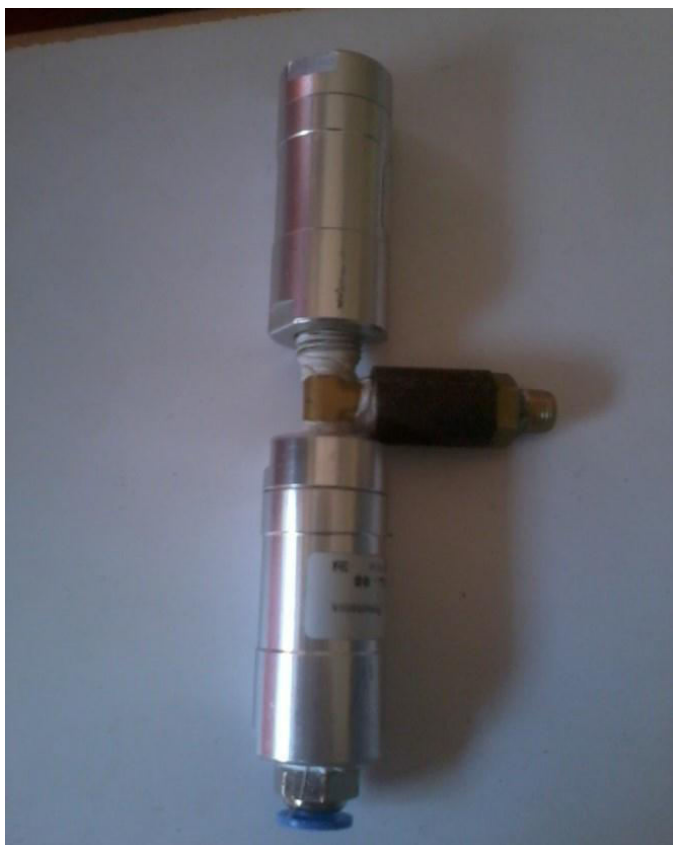
Fig.4: Non Return valve