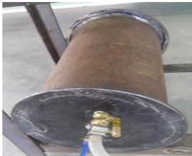
Fig.3: Air Tank

Air tank is used to store pressurize compressed air and supply this pressurize air for various use when required.