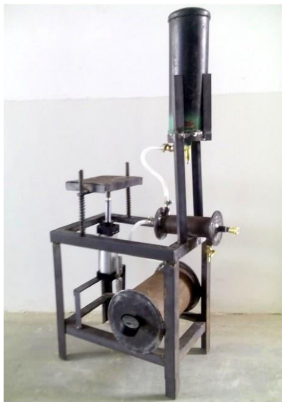
Fig.2: AC System by Using Vehicle Suspension

The complete diagram of vehicle suspension AC system is shown in fig. When vehicle is run on bumpy road or uneven road then suspension spring move continuously up and down. The pneumatic cylinder is installed below this spring arrangement. This pushing power is supplied to pneumatic piston and cylinder arrangement which compresses the air. This compressed air is supplied to air tank through non return valve. By the placement of non-return valve stops the back flow of pressurized air into cylinder again. That high pressurized compressed air is stored in air tank. When we want to turn on A.C. system the pressurized compressed air is supplied to parallel flow heat exchanger through nylon pipe by using knob. Storage tank is mounted at the top of the heat exchanger. In storage tank the nitrogen gas is used as refrigerant. This cold nitrogen gas refrigerant is supplied to heat exchanger. Low temperature coolant pass through the heat exchanger & also high pressurized air pass through it. Here heat exchange occurs and air temperature becomes 150 C to 300 C which is further send at the required place which is to be cooled.