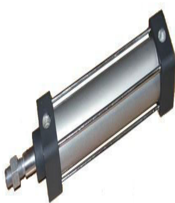
FIG.3: PNEUMATIC CYLINDER

When the shock absorber is operated the spring get compressed this pushing energy is send to pneumatic piston and cylinder which compresses the air taken from surrounding.