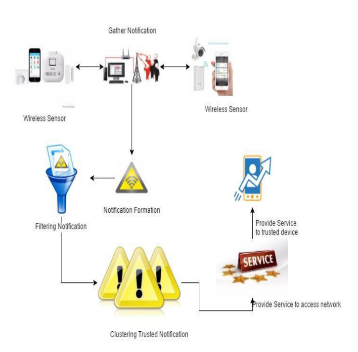
Figure 1: System Architecture