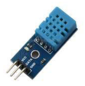
FIG 4 Humidity Sensor

From the fig 4shows that Humidity is the presence of water in air is. The amount of water vapor in air can affect human comfort as well as many manufacturing processes in industries. The presence of water vapour also influences various physical, chemical, and biological processes. Humidity measurement in industries is critical because it may affect the business cost of the product and the health and safety of the personnel.