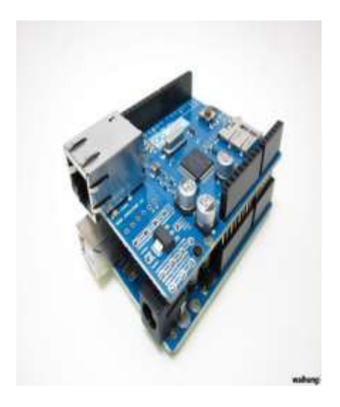
FIG :9 Ethernet Shield

is compatible with the Arduino Uno and Mega (using the Ethernet library). The onboard micro-SD card reader is accessible through the SD Library. When working with this library, SS is on Pin 4. The original revision of the Shield contained a full-size SD card slot; this is not supported. The Shield also includes a reset controller, to ensure that the W5500 Ethernet module is properly reset on power-up. Previous revisions of the Shield were not compatible with the Mega and needed to be manually reset after powerup.