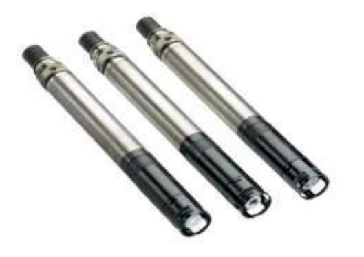
FIG :6 Nitrate Sensor

from <u>celluloid</u>. The use of nitrates in food preservation is controversial. The production of carcinogenic nitrosamines can be potently inhibited by the use of the antioxidants <u>Vitamin C</u> and the <u>alpha-tocopherol</u> form of <u>Vitamin E</u> during curing. Under simulated gastric conditions, <u>nitrosothiols</u> rather than nitrosamines are the main nitroso species being formed.