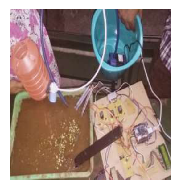
FIG 10: Output of the Green Field Monitoring using WSN

information can be viewed using LCD display device, along with that PH sensor, zinc sensor, nitrate sensor is added. PH sensor measures the soil is acidic or basic based on the value of the sensor what the plant is planted in the agriculture field. Soil mineral is measured with the help of Zinc and nitrate sensor, these minerals are filled in tank if the mineral level low automatically required mineral is added with water through the solenoid valve. All the information is send to microcontroller and the client can view the details through the internet server.