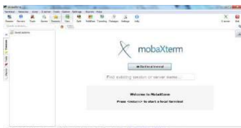
Fig: A view of the “MobaXterm” software

The data from the sensors are sent to the gateway through wires and the gateway and cloud communicate using the IoT protocol named MQTT. We push the data to the cloud with the help of a MQTT protocol. There are many protocols of IoT for various layers. The graphical view is created by means of a software named NODERED. This is the software used in case of IoT like Visual Basic for other controllers. “MobaXterm” is the software used to view the process in the gateway locally.