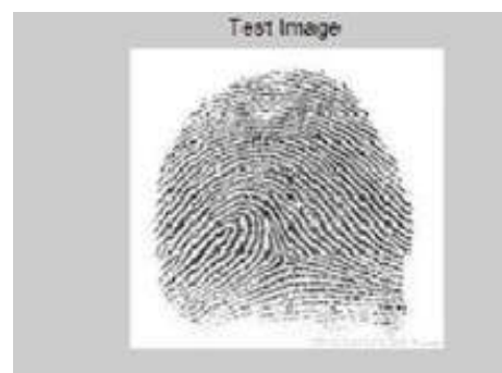
Figure 2. Test Image

The input is processed and verified with the trained image in the database and if it matches with the pre-stored image then the output will be displayed as it indicate the user to cast their vote. The given figure is the test image which is useful in verifying the results by comparing with the database. It also identifies the details in the fingerprint by processing the image while training.