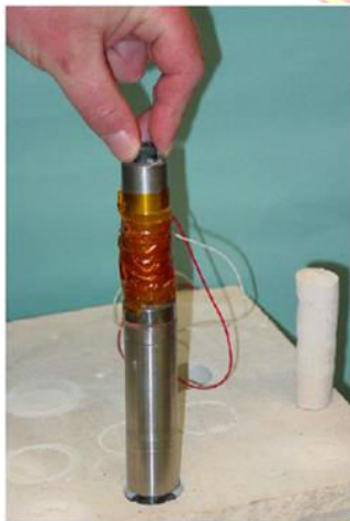
Figure 8. A schematic view of the gopher operating in a borehole, and a photographic view of the compact gopher and a formed core.

To conduct emergency treatments and deal with unpredictable health problems, the medical crews will need adequate tools and the ability to practice the necessary treatment at minimum risk to the astronauts. With the aid of all-in-one-type surgical tools and a simulation system, astronauts with medical background may be able to practice the needed procedures and later physically perform them. Medical staff in space may be able to sharpen their professional skill by practicing onboard simulated procedures or using new procedures that are downloaded from Earth. Generally, such a capability can also serve people who live in rural and other remote sites with no readily available full medical care capability. As an education tool employing virtual reality, training paradigms can be changed while supporting the trend in medical schools towards replacing cadaveric specimens with computerized models of human anatomy.