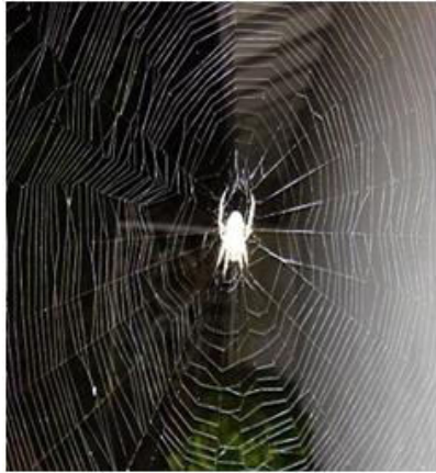
Figure 3. The spider constructs an amazing web that is made of silk material which for a given weight is five times stronger than steel.