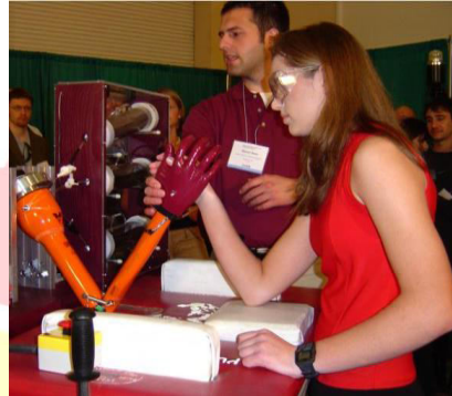
Figure 5. An EAP driven arm made by students from Virginia Tech and the human opponent, a 17 year old student.

In 1999, the author challenged the world's research and engineering community to develop a robotic arm that is actuated by artificial muscles (moniker for EAP) to win a wrestling match against a human opponent. The match's objectives are to promote advances towards making EAP actuators that are superior to the performance of human muscles. Also, it is sought to increase the worldwide visibility and recognition of EAP materials, attract interest among potential sponsors and users, and lead to general public awareness since it is hoped that they will be the end users and beneficiaries in many areas including medical, commercial and military. The first arm-wrestling competition with a human was held against a 17 year girl on 7 March 2005 and the girl