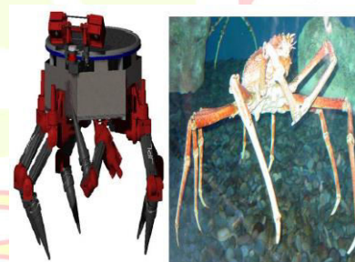
Figure 4. The six-legged robot, LEMUR (Limbed Excursion Mobile Utility Robot), which is developed at the Jet Propulsion Laboratory and the eight-legged crab in an aquarium.

These materials have a faster response, a greater mechanical energy density, and they can be operated in air. In contrast, ionic EAP materials (gels, ionometric polymer-metal composites (IPMC), conductive polymers and carbon nanotubes) require drive voltages as low as 1–5 V and produce significant bending. However, bending actuators have relatively limited applications for mechanically demanding tasks due to the low force or torque that can be induced. Also, with some exceptions, these materials require maintaining their wetness and when containing water they suffer electrolysis with irreversible effects when they are subjected to voltages above 1.23 V. Except for conductive polymers, it is difficult to sustain dc-induced displacements.