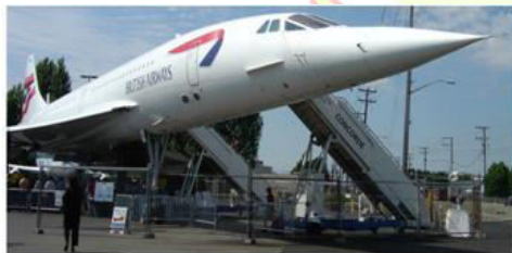
Figure 1. The desire to fly was implemented using aerodynamic principles leading to enormous capabilities such as the supersonic passenger plane, the Concorde.

Through evolution, nature has 'experimented' with various solutions to its challenges and has improved the successful ones. Specifically, nature, or biology, experimented with the principles of physics, chemistry, mechanics, materials science, mobility, control, sensors, and many other fields that we recognize as science and engineering. The process has also involved scaling from nano and micro to macro and mega. Living systems archive the evolved and accumulated information by coding it into the species' genes and passing the information from one generation to another through