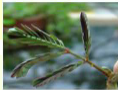
Figure 2. The sensitive fern has its leaves open (left) until they are touched (right).

Surviving organisms that nature created are not necessarily optimal for the organism performance since all they need to do is to survive long enough to reproduce.