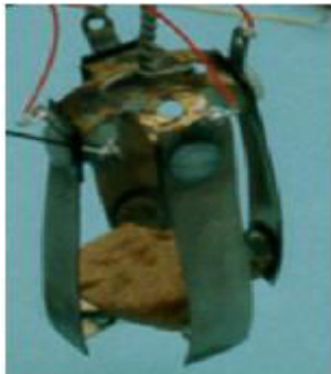
Figure 6. Four-finger EAP gripper lifting a rock similar to a human hand.

production, consumer demand and cost per unit can be critical to the transfer of technology to practical use.